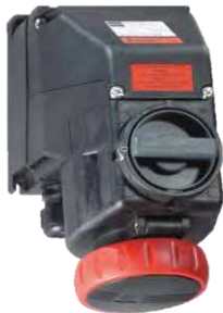
Plugs & Sockets